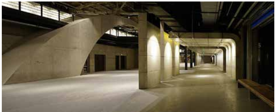
TaoXichuan Art Museum